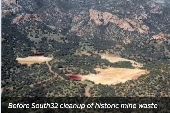
Before South32 cleanup of historic mine waste

Lastly, the surface footprint for South32's Hermosa Project is just 600 acres. That's a fraction of the footprint of other mining projects, which often stretch for thousands of acres. We are targeting an underground mining method that will also involve backfilling the stopes as we progress. This advanced method greatly reduces the volume of stored tailings on the surface while all but eliminating subsidence of earth at the surface.