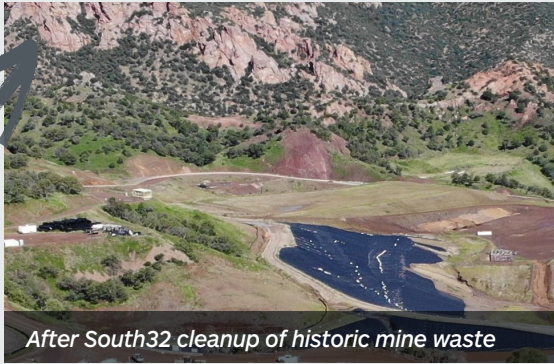
After South32 cleanup of historic mine waste